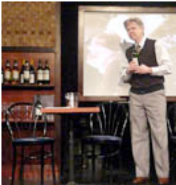
Bark to Bottle, Issue #23, June 2008: Amorim

Amorim supplied 5000 corks for the set of 'Wine Lovers – The Musical'.